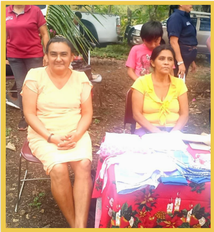
El Corozo, San Dionisio Sewing Collective