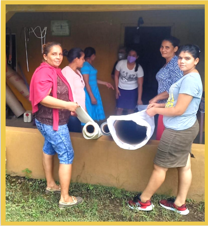
La Virgen, Nagarote Sewing Collective