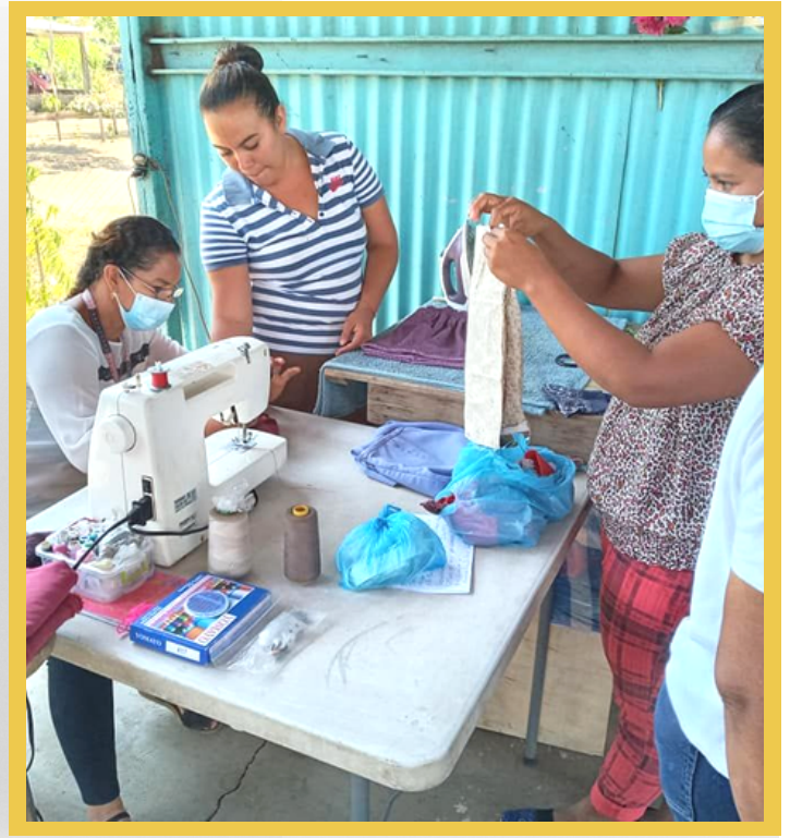
La Sabaneta, La Paz Centro Sewing Collective